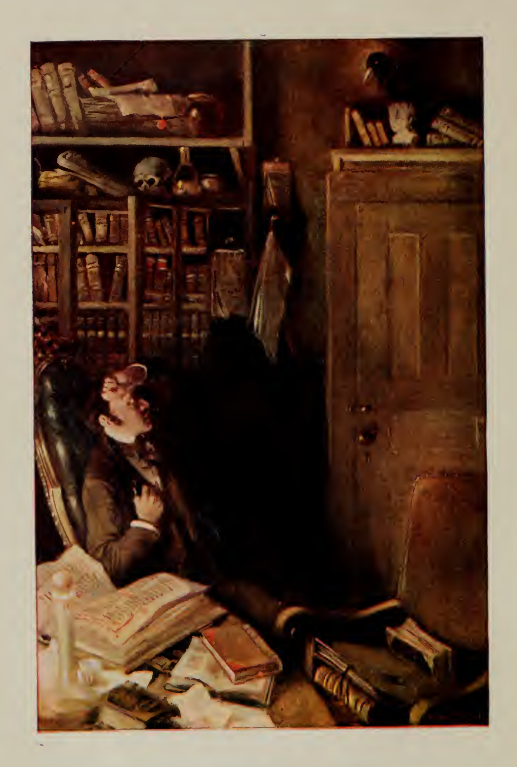
"'Be that word our sign of parting, bird or fiend!" I shricked, upstarting."